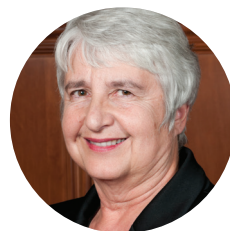
Chief Justice Dame Sian Elias