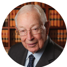
Sir Anthony Mason