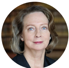
Chief Justice Susan Kiefel