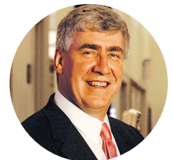
Professor Jeremy Waldron