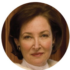
Justice Rosalie Abella

Featuring a distinguished faculty of national and international speakers including: